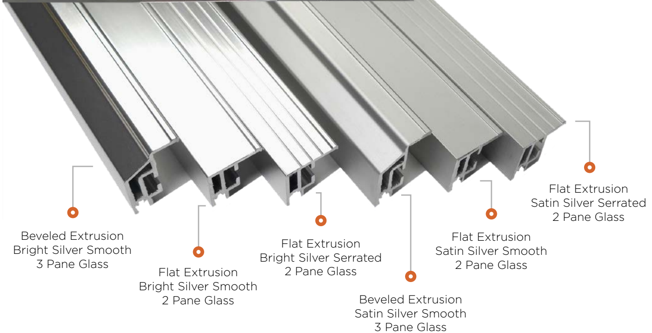
Bright Silver Smooth Shown

Contact Factory for Availability of Specific Extrusions