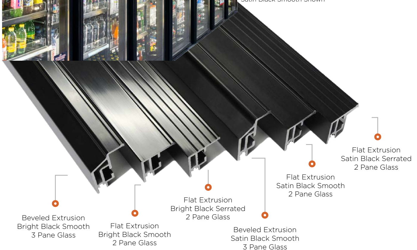
Satin Black Smooth Shown

Contact Factory for Availability of Specific Extrusions