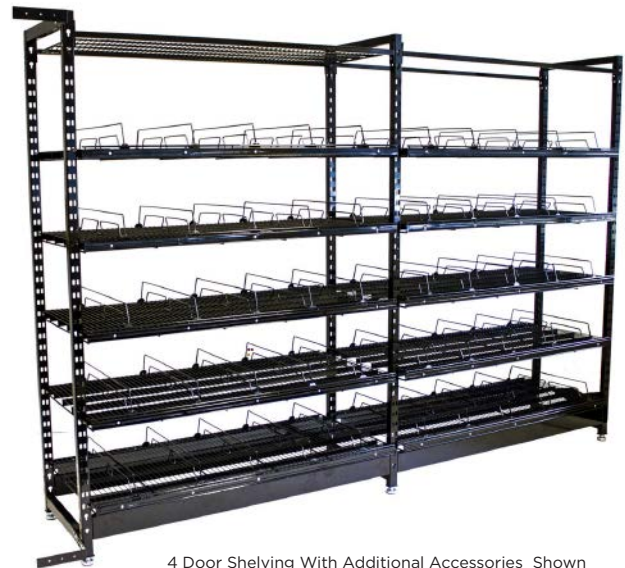
4 Door Shelving With Additional Accessories Shown