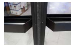
Standard Push Bar