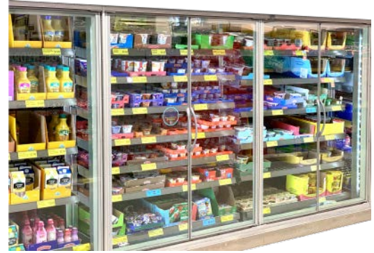
French Hinged Style Shown