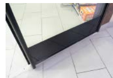
Front Silk Screen