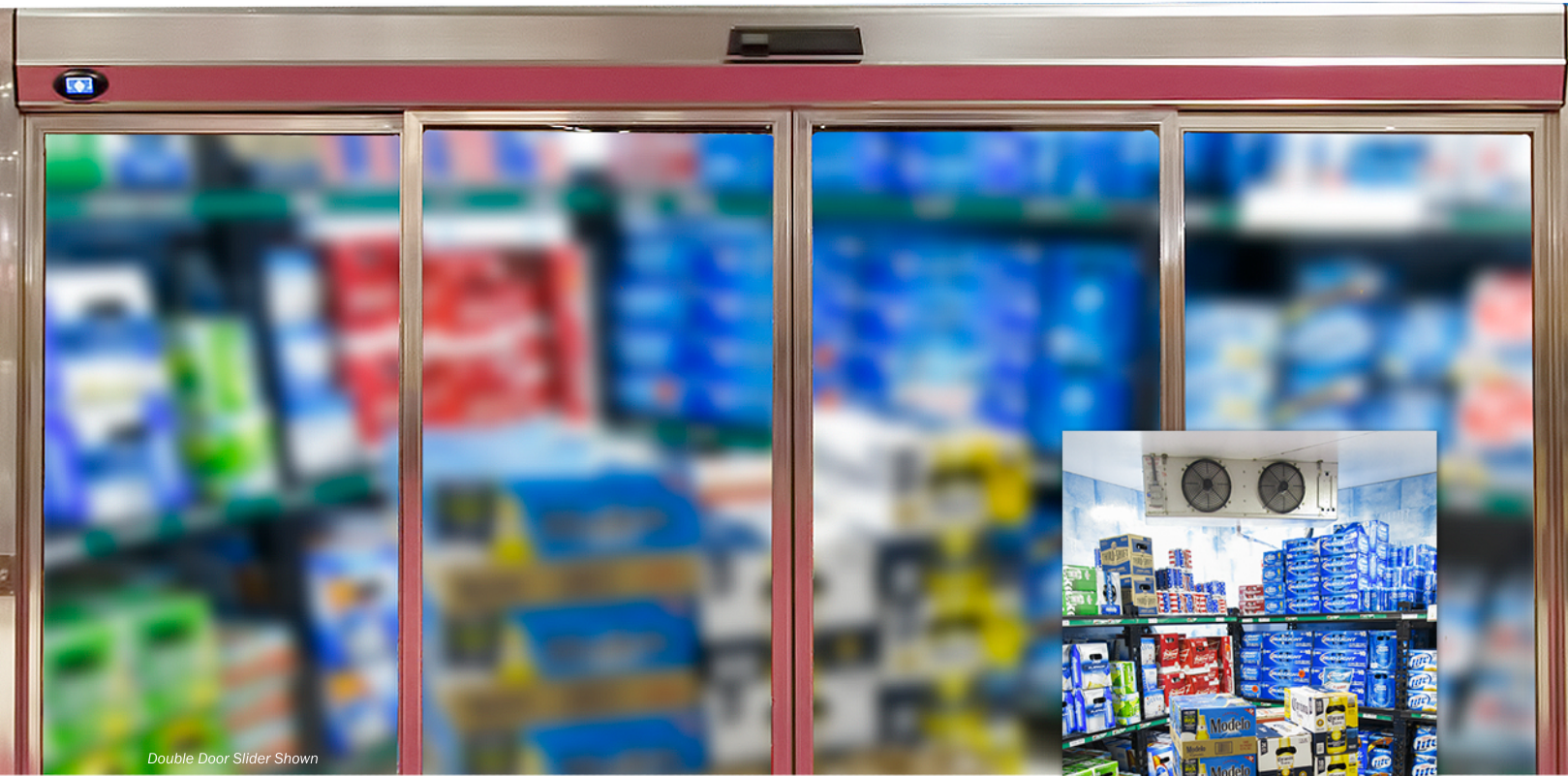
Double Door Slider Shown

“In short, caves are a perfect store addition if you wish to boost traffic and profit for your store.”