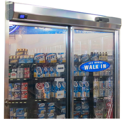
Single Door Slider Shown