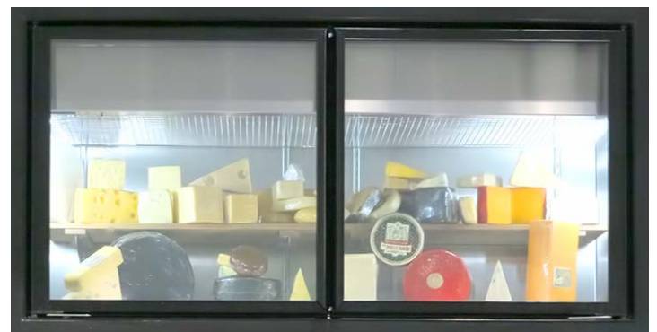
Double Half Doors Shown

All STYLELINE ® doors are DOE compliant.