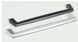
Standard Handle Finishes