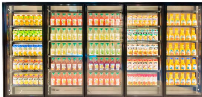
STYLELINE® CL Series Shown

Accessories are only available for STYLELINE RM, CL Series and FX.