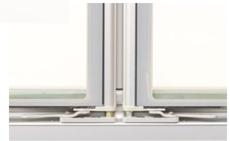
Bottom Door Hinge