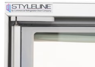
Top Door Hinge