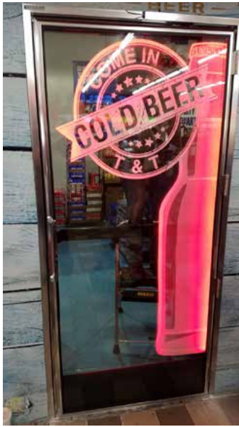
* Shown with optional custom illuminated glass