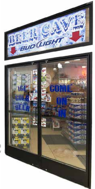
Shown with optional Fixed Window