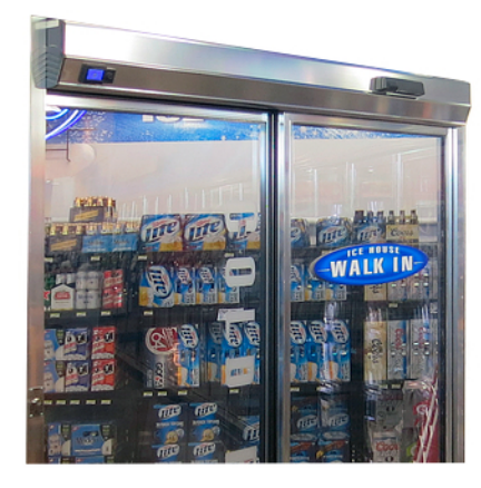
Single Door Slider Shown