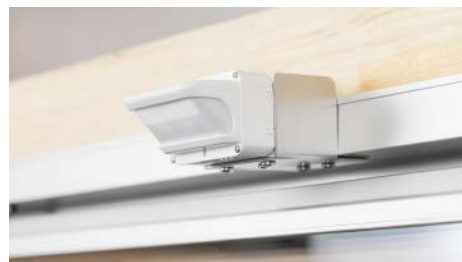
Ambient Sensors & LED Motion Sensor Installed