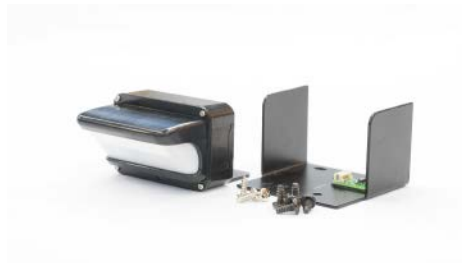
LED Occupancy & Anti-sweat Sensor Kit. Supplied with High Humidity, Freezer and Entrance Doors with LED lighting. White for Silver Frames. Black for Black Frames.