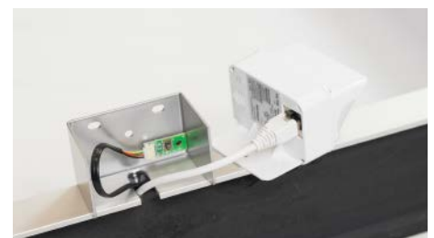
LED Motion Sensor & Ambient Sensor Connected